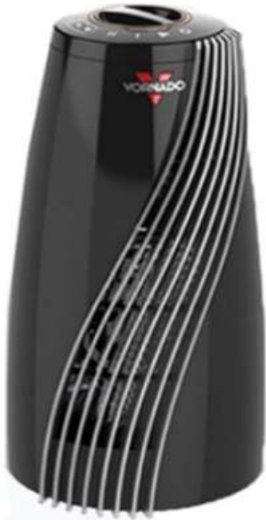
Recalled SRTH Small Room Tower Heaters